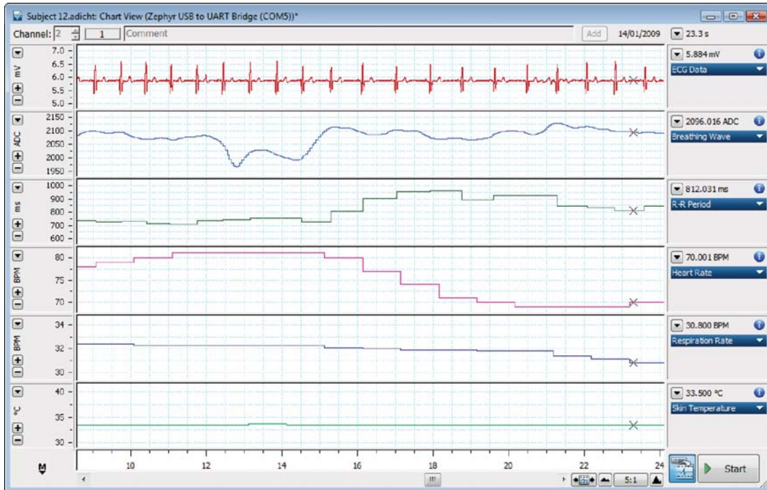
Channels 1- 6 seen in the BioHarness Chart View

Skin temperature as measured by infrared sensor in apex of device; minimum value 10, maximum value 60