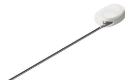
Mouse Biopotential telemeter