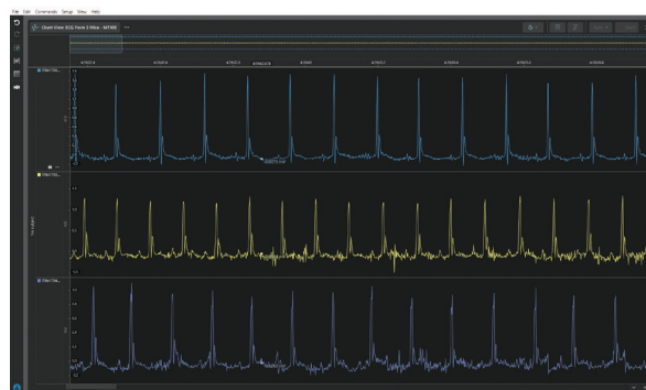
ECG recording from three mice in LabChart Lightning

Venue: Florey Institute, Melbourne (room details to follow)